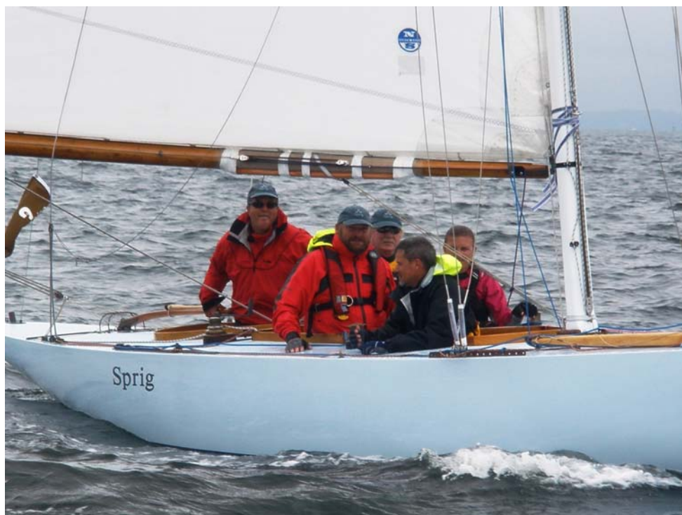
Sprig crew during a relaxed minute at the 2009 6 Meter World Cup photo courtesy Leslie Jenness, aboard Bystander